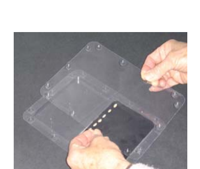
Close the test plate with its transparent lid, taking care that the seeds don't move during this operation