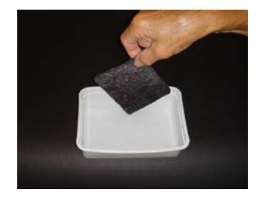
Take the pads out of the water and drain all excess water