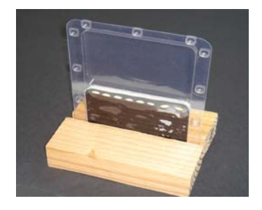
Put the test plate vertically between 2 supports in a room at ambient temperature

Observe at regular intervals the evolution of the germination of the seeds and of the early growth of the roots and the shoots