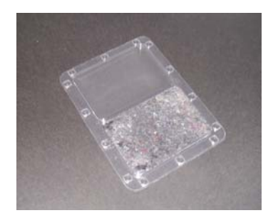
Turn the closed test plate upside down and leave it in a horizontal position for a few hours to allow the seeds to hydrate completely