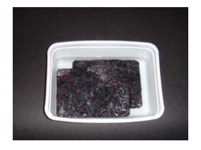
Put the 2 moistening pads in tapwater to hydrate them completely